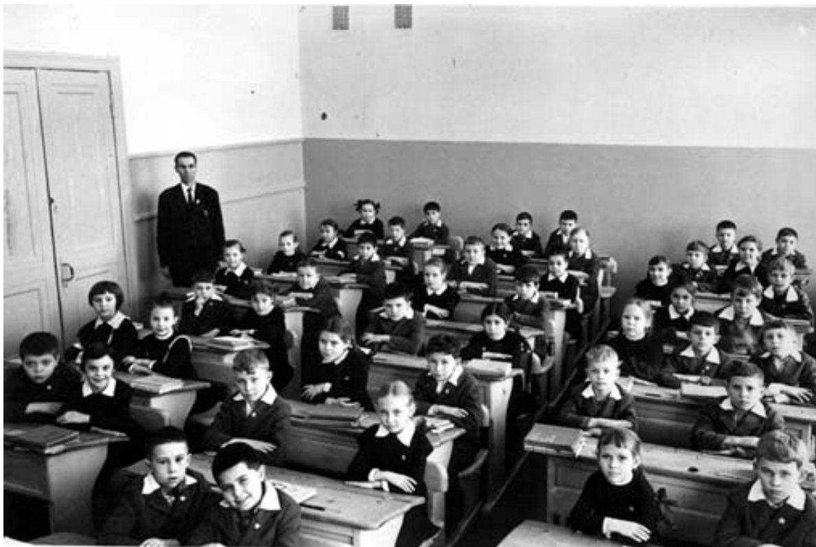
Picture 3. My second-grade classroom, Moscow, 1969 (photo from my personal archive)

Let me contextualize and exemplify the points above through analysis of my second-grade classroom (see the photo below):