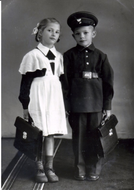
Picture 4. School uniform in tsarist schools before 1917 ( http://dubikvit.livejournal.com/57103.html )