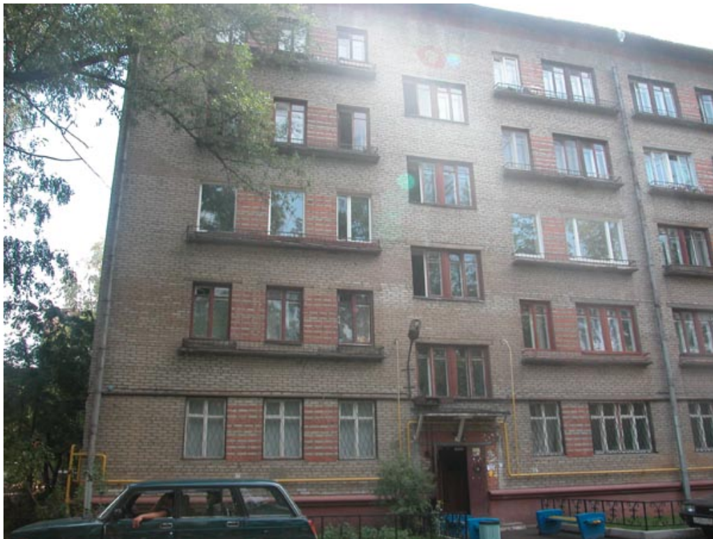
Picture 1. I lived in this building from 1968 until 1974/1977 on the fifth floor on the left (photo is mine, 2002)

When I was 8, we moved to another, bigger apartment in Moscow, and I had my own room for the first time.