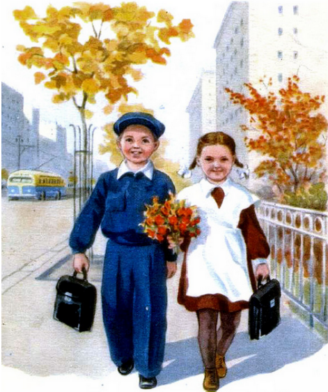
Picture 6. Khrushchev's era school uniform of the early 1960s ( http://dubikvit.livejournal.com/57103.html )