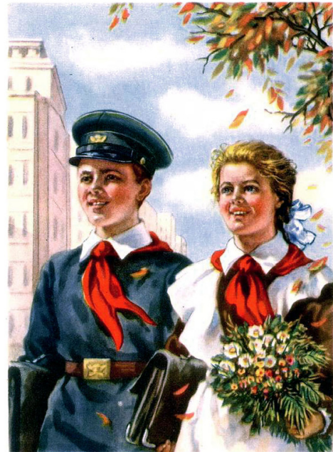
Picture 5. Stalinist school uniform for Pioneers in the late 1940s – the early 1950s, a communist organization for children ( http://dubikvit.livejournal.com/57103.html )