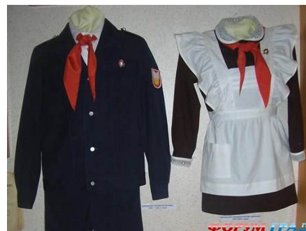
Picture 7. Brezhnev's era school uniform of the late 1970s, the beginning of the 1980s