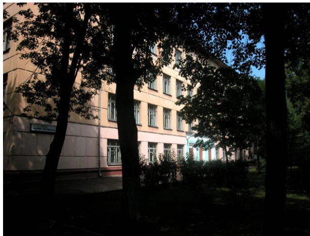
Picture 10. My “beloved” school 145, on which I tried my “laser” to cut in half. I attended it from 1968 until 1974

We also “built” a “powerful” laser out of my film projector to control the world. 45 This resulted in a huge explosion in my room when I tested the “laser” trying to cut my school building in half at night when nobody was in school (we lived on the fifth floor and windows of my room were opposed my “beloved” school). This fantasy was my rather clear response to an oppressive nature of Soviet schooling.