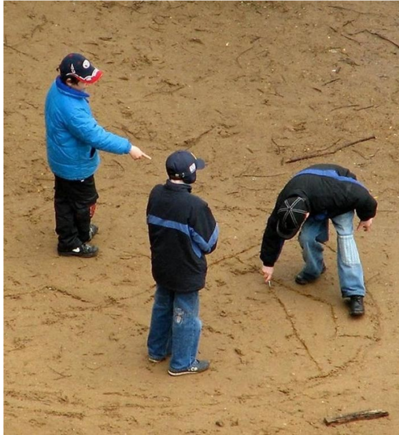
Picture 8. We often played a game called "knives." We drew a circle divided equally among the number of participants. Each stood on his land. Then the participant stuck a knife in the standing portion of the enemy and cut off a piece of his land as much as he could get while staying on his own territory. If one's knife was "wounded" (was not stuck or missed the other's territory) – the move was transferred to the next participant. And by the same rules we had all the time to stand on their own land as long as you can. According to other rules, one could be outside, but in the event of a catastrophic reduction in your area, the enemy offered you three seconds to stand on it. If you cannot resist – you are eliminated from the game. The stand can be even one foot on tiptoe - the main hold for three seconds. http://supercoolpics.com/samye-nebezopasnye-veshhi-kotorymi-razvlekalis-deti-v-sssr/?fb_ref=3d8f978964de48449a7778d88583674a-Facebook

We went to numerous construction sites for play and search for valuable materials like lead, which could be easily melted and given a desired artistic or pragmatic form (e.g., a skull, a puck, a ball), or colorful plastic twisted wires used for electrical isolation (it could be pricked in a cloth and then melted with a match flame to create very beautiful forms), and so on. Once a construction worker caught me (9-year old), grabbed my arm and dragged me out the site to bring me to a local police station. On the way to the police, I tried to free myself and escape but it was in vain. My peers followed us in distance, verbally assaulting the construction worker and demanding my freedom. Suddenly, I changed my strategy. I stopped trying to free myself, looked straight at the worker eyes and said, "Dear uncle, forgive the asshole" ("Дяденька, прости засранца 37 "). The worker stopped with surprise, looked at me, and started laughing. He asked for my word not to get to a construction site again, explained to me how dangerous it was for all and especially for little kids like me, and let me go. My peers were shocked (they could not hear my conversation with the worker) and I gained a lot of respect from them for making the adult do what I wanted him to do. With some initial hesitation, I returned back to constructions sides in a few weeks through peer pressure.