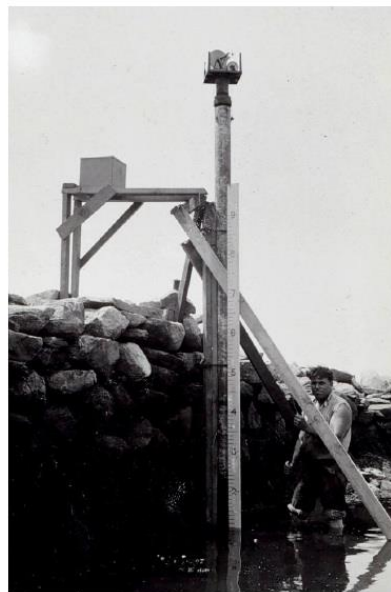
Figure 1. Example of excerpted scientific study.

Church and White used a special tool called a "tide gauge" in their own observations of sea level, and this is a tool that has been used since the very beginning. The following picture shows a tide gauge.